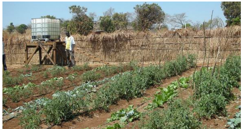
FIELD OF VEGETABLES IN MALAWI