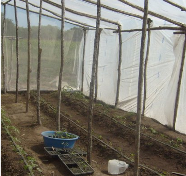
Bucket Kits in simple greenhouse

Mr. Jim Stanchfield writes "One of the projects on the island is to boost farming output with your Bucket Kits and simple greenhouses. The use of Bucket Kits is spreading among the island people."