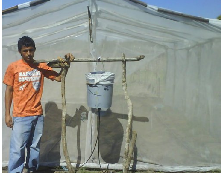
Five families now have Bucket Kits set up