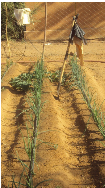
Bucket Kits In Gao