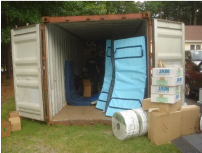
Loading the Bucket Kits, 1/4 Acre Kits and Super Bucket Kits.