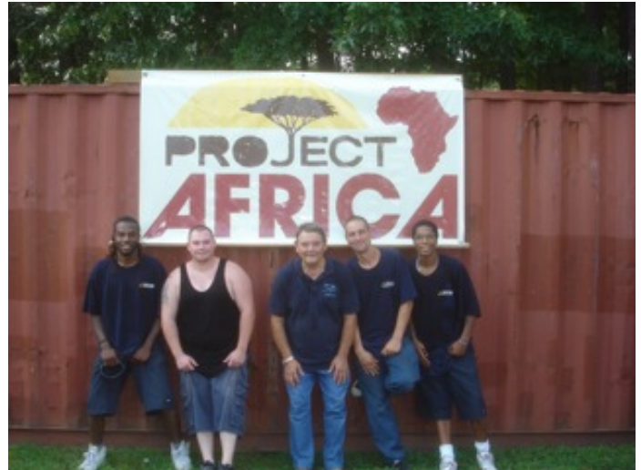
The “brothers from the hood” who helped load the container.